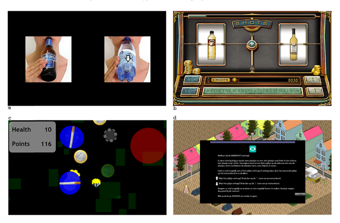
Fig. 1. Four versions of CBM-Attention using different types of game-elements. a . The original Visual Probe Task (VPT), without game-elements. b . Shots Game , a game version of the VPT, using the same set-up, but with various game-elements added. c . BombDodger Game , which is based on scientific attention and approach bias principles, but with a different form of presentation. d . City Builder Game , where the original VPT, with added progress bar and point reward system, is integrated within a game-shell.

W.J. Boendermaker et al. / J. Behav. Ther. & Exp. Psychiat. xxx (2015) 1-8